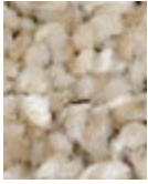
00100 CREAMY SIL..