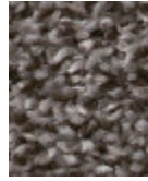
00501 SALT AND P..